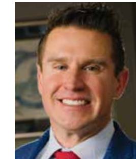
Alex Carter Water Departments (Treatment, Distribution and Collection)