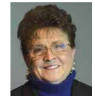
Betty Black Street Department & Cemetery